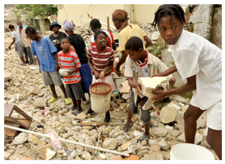
After the earthquake, everyone worked together to clear the rubble.

It was in this difficult context, aggravated by a new political crisis, that the tragedy of January 12, 2010, struck. For almost half a minute, the metropolitan area of Port-au-Prince was rocked by a catastrophic earthquake. More