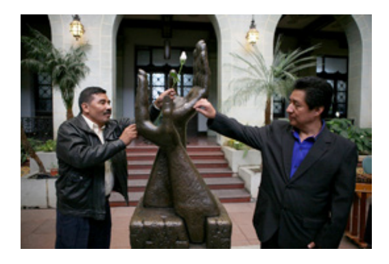
Guatemala: ATD members changing the White Rose of Peace on October 17, the World Day for Overcoming Poverty.

In their daily lives, many Guatemalan women and men continue to resist the violence rooted in the injustice of poverty, in order to build links among people in the heart of their communities. Following years of courage and perseverance, October 17, the World Day for Overcoming Poverty, has become a time when all of them can draw strength from the public recognition of their commitment as members of our movement. Each year on this date, one of them is chosen by the government to change Guatemala's White Rose of Peace, a daily ceremony begun after their civil war in order to show the nation's hope for lasting peace.