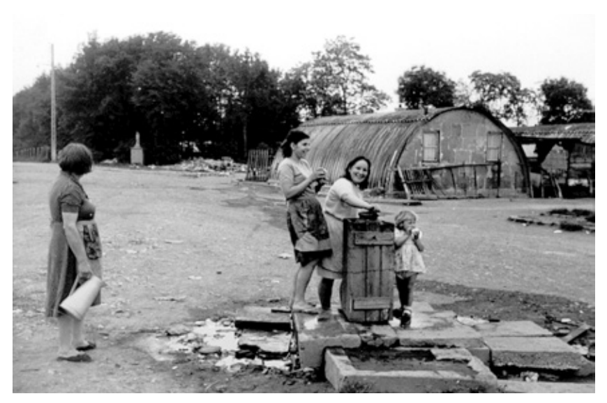
The emergency housing camp of Noisy-le-Grand, France, where Joseph Wresinski founded ATD Fourth World in the 1950s.

While our members today come from many countries and from different backgrounds, the way in which we were founded has shaped the way we work: continually seeking out people who may be the most isolated or stigmatized by situations of persistent poverty and together continually re-centering our approach. This population became the starting