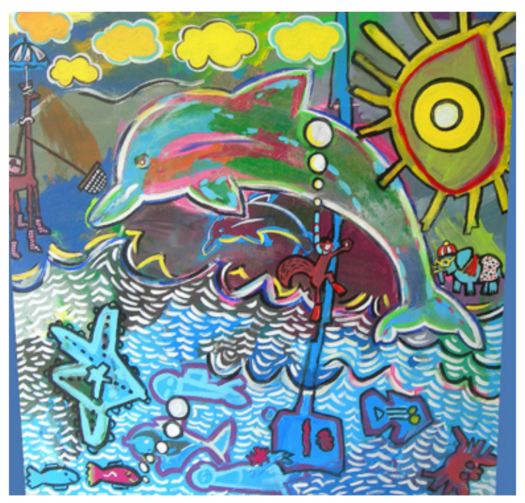
"If we hadn't painted, the neighborhood would have been dead for us, our neighbors, and all the residents."

Usually not everyone does get involved, even for a demolition. I held out for a while. I've seen plenty of demolitions, but this is the first time I saw anything like this for a demolition. Usually, you're just staring at bricked-over walls."