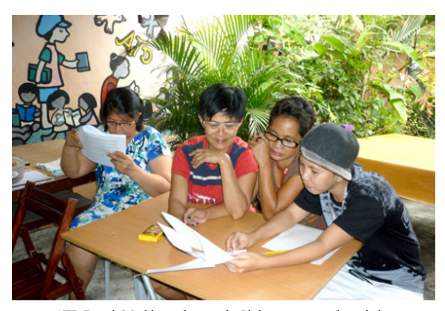
ATD Fourth World members in the Philippines merge knowledge in 2013 as part of our action-research project to evaluate the Millennium Development Goals (MDGs).

Our work is focused on taking steps for people of different backgrounds to recognize one another's dignity, to learn to think together, to develop collective knowledge, and to progress in co-responsibility for learning to work together, to live in communities together, and to face the world's challenges. This is a crucial step toward peace.