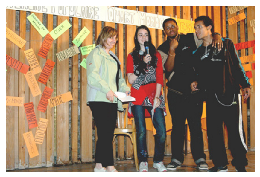
Reciprocity and respect: Young people express their views at a Fourth World People's University in France.

When power is equally balanced among different sources of knowledge, cognitive governance can produce new knowledge that is relevant to understanding and changing society. By building collective knowledge, People's Universities make it possible to break cycles of misunderstanding and distrust. They make it possible to overcome ignorance of how others live, and to reconstruct analyses of the world that are truncated because they lack the contribution of people living in extreme poverty. This is a dynamic that builds peace by making it possible to understand sources of violence, injustice, and ignorance, while finding ways to rebuild together.