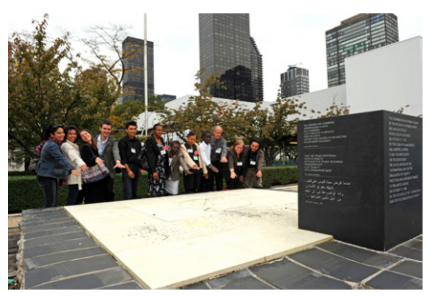
October 2010: Some of the Haitian delegates with others from Honduras and the United States, at the Commemorative Stone in Honor of the Victims of Extreme Poverty in the garden of the United Nations headquarters in New York.

poverty and facing impossible choices. Members of ATD carry this ambition toward the horizon. In October 2010, we asked them to send a delegation to an international assembly. They managed to obtain identity documents and passports when the country was still on its knees and most ministries destroyed in the rubble. They dared to believe that the United States Consulate would understand their need to meet and think with others. They were right to believe it, and this is how ten adults, teenagers, and children living in the no-go zone of Port-au-Prince were awarded visas to participate in our international assembly in the United States, "It Takes a Child to Raise a Village." Every one of them was granted a visa, as it should be, despite an era when refusals are almost automatic for those who cannot prove they have means considered sufficient to live on in the host country. They were well aware and proud of their responsibility to all the others in whose name they traveled, those who are too buffeted by poverty to tell anyone of their courage and their daily efforts to defend the right to live in dignity. They were moved and curious to discover the