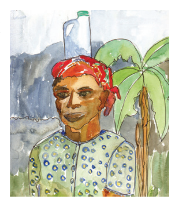
The four paintings in this chapter are by Fourth World Volunteer Jacqueline Page.

these and other projects propose a path to education and health, but at the same time they also help create a community spirit by supporting those who, with humility and discretion, are committed to their neighborhoods. Forming a community is a challenge when you struggle to survive day to day. But community is vital for sharing moments of joy, just as for coping with hardship. All the work done toward forming a community was thwarted in 2000–04 when weapons were delivered to young people who felt the need to organize themselves to protect their neighborhoods in the absence of the police. Neighbors then found themselves mired in overwhelming conflict. In less than a decade, this violence has divided neighborhoods, with many families losing loved ones, and with any recourse to justice compromised by a widespread lack of confidence in a weak judicial system.