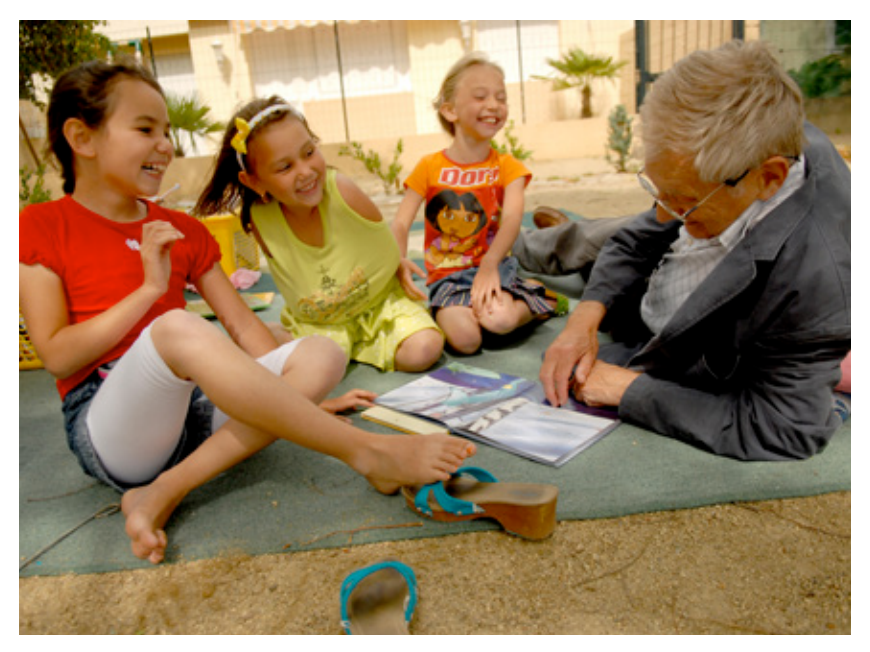
Street Library in Europe.

The Story Garden, Street Libraries, and Festivals of Shared Learning nurture children's desire to learn and develop their creativity. We also run projects with teenagers and adults—including creative writing workshops, painting workshops, and choirs—where everyone has the chance to discover that they have something unique to share with others. The goal of these projects is to share culture, art, beauty, and creativity for the development of each person. Because art has the capacity to transform the way people see themselves and one another, a movement to end poverty needs collective artwork and the creativity of artists to express a common humanity.