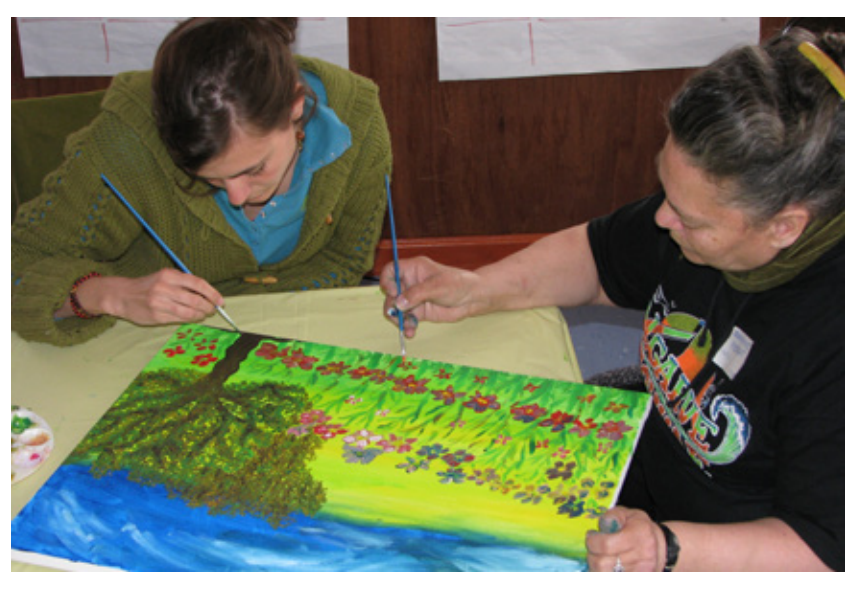
At an art and creativity seminar, painting and poetry were key elements: "Trust ourselves. Trust others. Your note, your color is awaited."

The opposite can happen as well. I've seen people relax their bodies, compose their gestures, and release their hands. The beauty of those moments is dazzling and fleeting. Often without words, those moments can become touchstones in the daily chaos. [...] The greater the external difficulties in our society are, the more vital it is to offer tools that reinforce the inner potential of each person. This nourishes an understanding of existence, of the self within society, so that we don't gulp down whatever others say and can resist the external events that are beyond us.