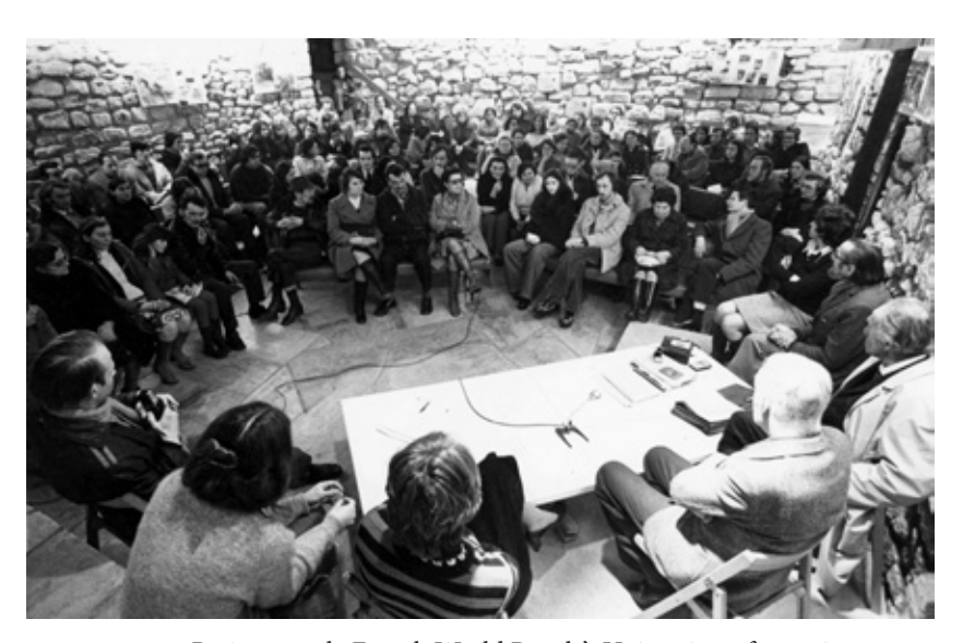
1980s, Paris: an early Fourth World People's University, a forum in which people in extreme poverty can speak with complete freedom about what motivates them and gives them strength.

up first. We'll see later what to do about the poor," or "You'll see, economic growth will eliminate poverty." In 1982, on meeting a delegation of our members living in extreme poverty, the European Commissioner for Employment and Social Affairs, Lord Ivor Richard, observed: "In Europe in fact, the poorer people are, the less political representation they have."