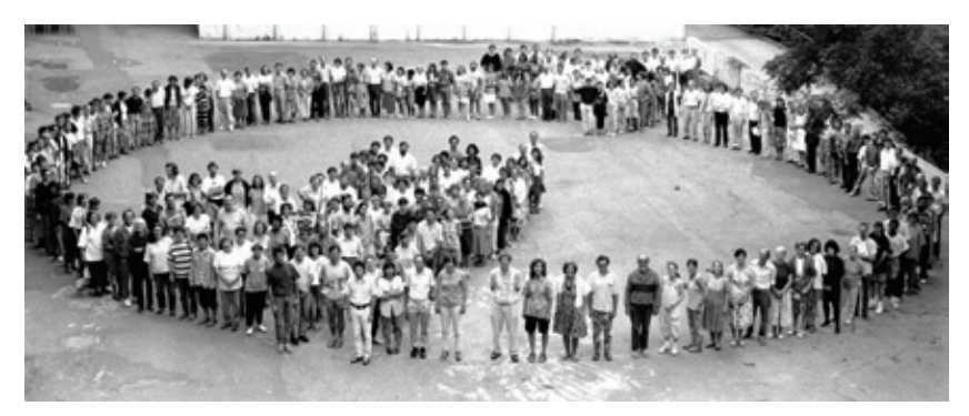
Members of the Fourth World Volunteer Corps gathered for a General Assembly in 1999.

Via an ethos of equality, collective responsibility, and interdependence, all volunteers receive the same basic stipend linked to the cost of living in the country in which they are based, regardless of seniority or responsibility. They are also available to live and work full time in differ-