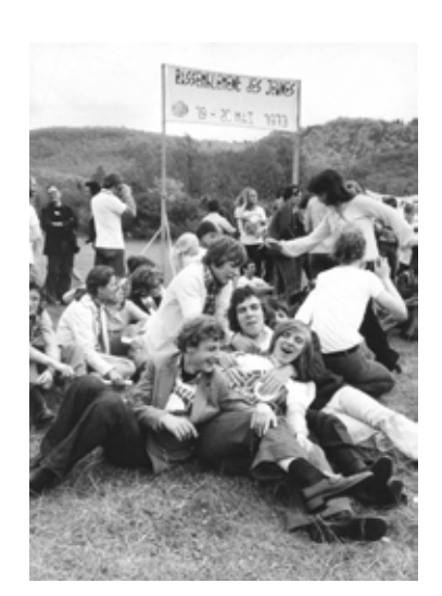
The May 1973 youth gathering.

You're not just anyone! You are among those who have inherited the world's misery. It's been dumped on your shoulders and it stops you from lifting your heads and revealing the truth to the world. Here in this field, there are only 300 of you to represent the others, all the others, those who weren't able to come and who are frustrated because of it, those who have the same worries as you, the same determination. You want it to be possible to truly live in your