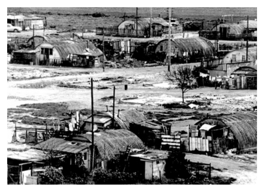
Noisy-le-Grand, France, in the 1950s.

point and remains the driving force behind bringing people together from a wide diversity of social and cultural backgrounds and of beliefs and convictions. Beginning in 1957, little by little, one person at a time, generation after generation, this uniting of people to act for peace continues today with hundreds of thousands of people in over one hundred countries.