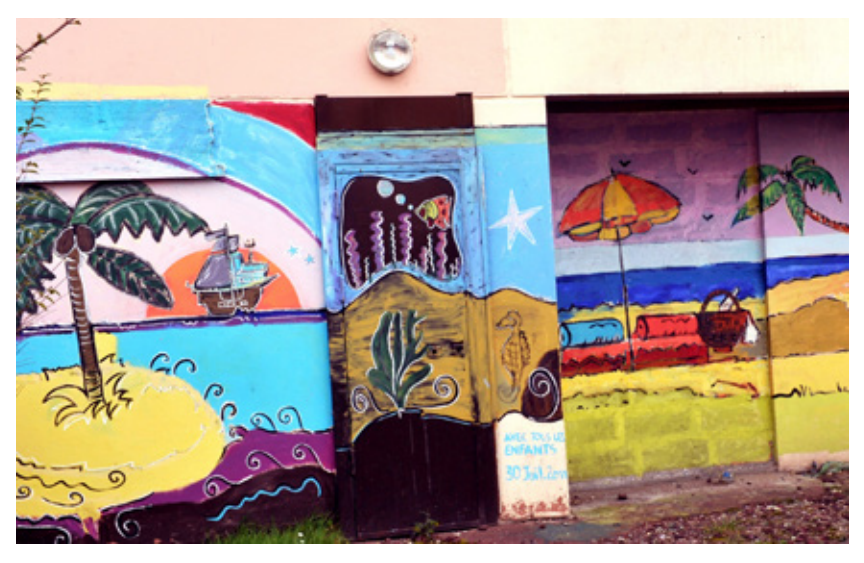
Their homes slated for demolition, Noisy-le-Grand residents painted murals in 2012.

Now the neighborhood is almost empty of residents. The ones still living in these row houses seem to me the most dynamic, those who