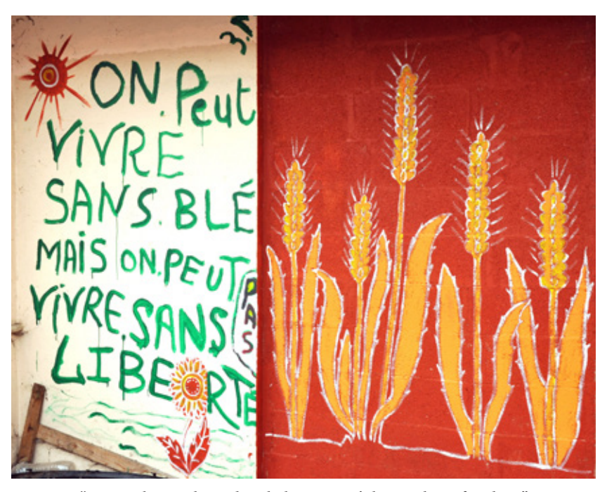
"We can live without dough, but we can't live without freedom."

dared to refuse other housing. Did they choose well? These same families say that painting the walls is just hiding misery, and it's true. Some think that the colors changed the nature of the community. So for a while, we all stopped painting. I live here, you live here, we live here. There's no point in being glad that a TV crew came to film the new face of the housing project, or that a local lady with her cane and lapdog came to visit a street she had never before looked twice at. The point is first of all to live together as a community, and then to take part in a common struggle for society to be fair. The point is changing how we look at one another, how we conceive of the world. The point is being able to believe in the future. Searching together for peace—but not at any price.