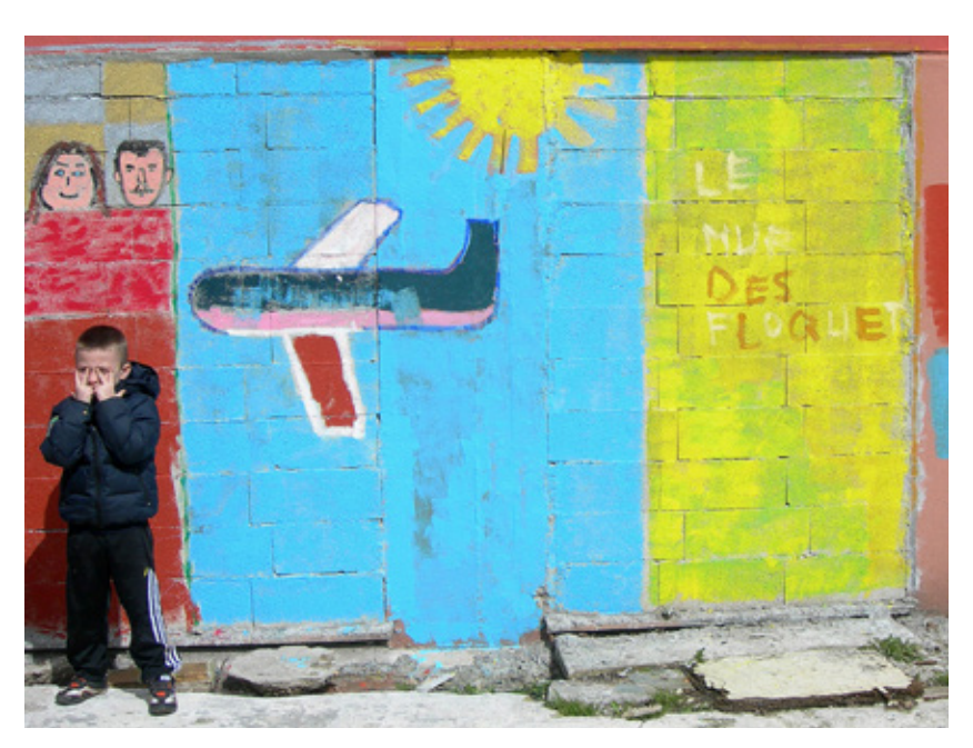
"I'll paint an airplane with the whole family! The plane's gonna blow up, but the hero will save everyone!"

Back in Noisy-le-Grand, a few days after the father's death, his younger son, age 7, asked whether he could paint one of the walls of the housing project. His eyes lively and sparkling, he said, "I'll paint an airplane with the whole family! The plane's gonna blow up, but the hero will save everyone!" So we let him paint his idea. The brightly colored plane, in a radiant sky, flies toward a somber wall, above which the portraits of both his parents are smiling. The hero was not painted, but in [one] photo, the boy hiding his eyes certainly reflects him. As he and his brothers grow up in this housing project with its joys and