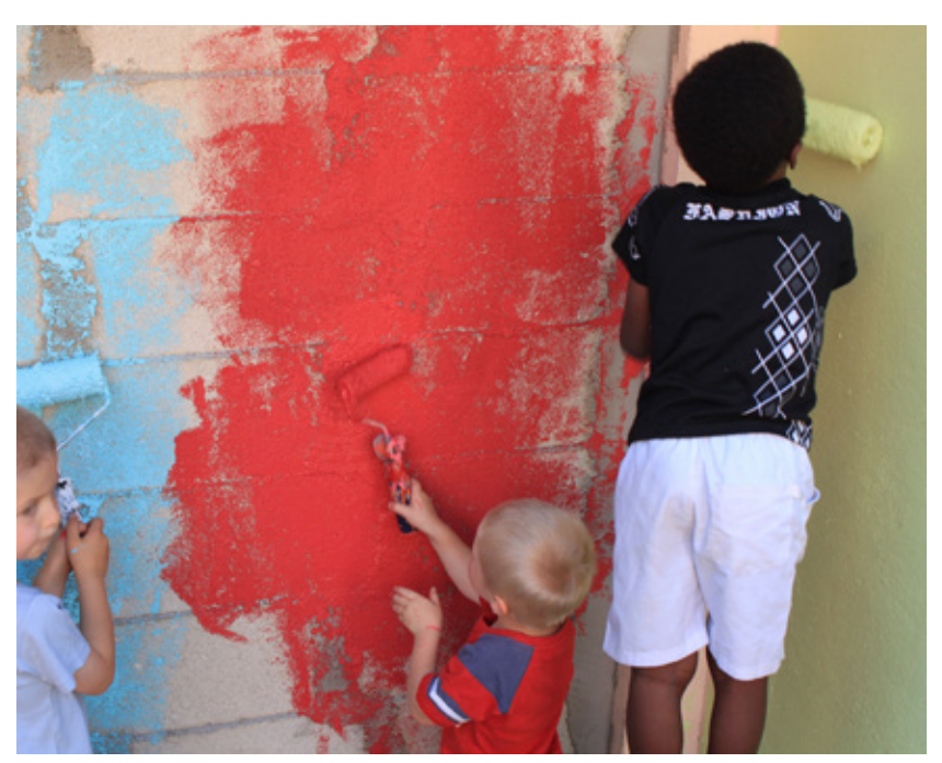
In a housing complex set for demolition, "high and mighty three-and-a-half-year-olds" wanted to paint.

With other adults and children, we still paint the walls and the brickedover windows. One of the mothers asked me to help her decorate her apartment by painting friezes of flowers; another chose to paint festival scenes. Several of the parents requested portraits of their children.