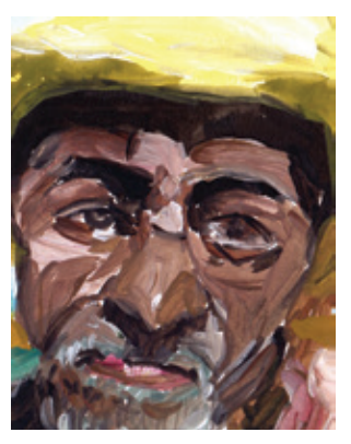
"Gunshots in the City, the Old Man Listens."

public building. The pride and hopes raised by the construction of the school were dashed when it was militarized. Still worse, the unintended consequences of the "disarmament" campaign carried out from this head-quarters served only to bring still more weapons to the area. The approach chosen to "disarm" young people was to offer them short-term public works jobs. However, the income from these jobs went to phantom organizations set up by gang leaders who then used the money to purchase