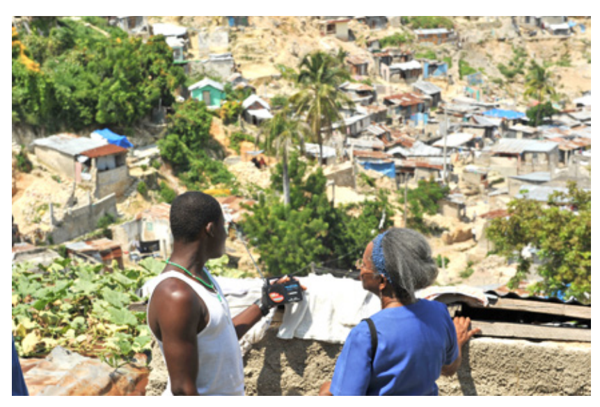
ATD members make plans to visit families in the heights of Martissant.

Instead, it was the young people who ensured that everything went smoothly when the distribution began. Every day they spent time chatting with the people waiting in line. When parents lacked identity documents for themselves and their children, our volunteers, who knew them all well,