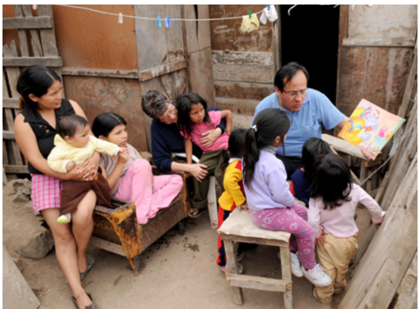
Street Libraries in Asia and South America.