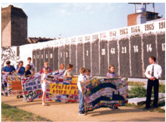
At the foot of the Berlin Wall, 1992: Inauguration of a replica of the Commemorative Stone in Honor of the Victims of Extreme Poverty.