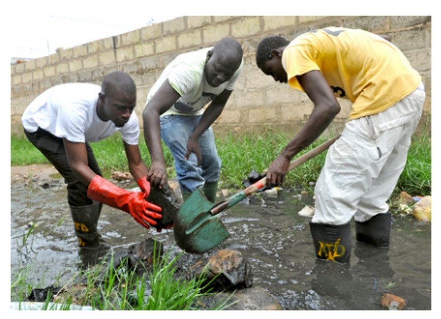
The flood-fighting brigade in Pikine, Senegal.

team in France; and advising on the steering committee for an international participatory action-research project.