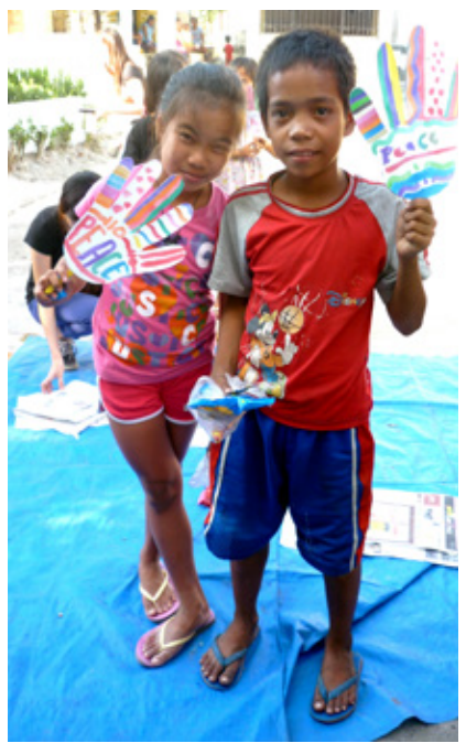
Street Libraries always include a time of creativity, like here in the Philippines.

Despite the strong need to create, people enduring the violence of extreme poverty have the least access to paintbrushes, to music lessons, to creative writing. We believe that it is worth investing heart and soul in musical and artistic creativity because that creativity can bring about transformations. That creativity can liberate each one of us, making it possible to see ourselves in a new way. That creativity can level the playing field, enabling people with very different levels of formal education to communicate. And that creativity can change the way that society looks at people living in poverty by showing us that because we are all part of a common humanity, we can live together differently.