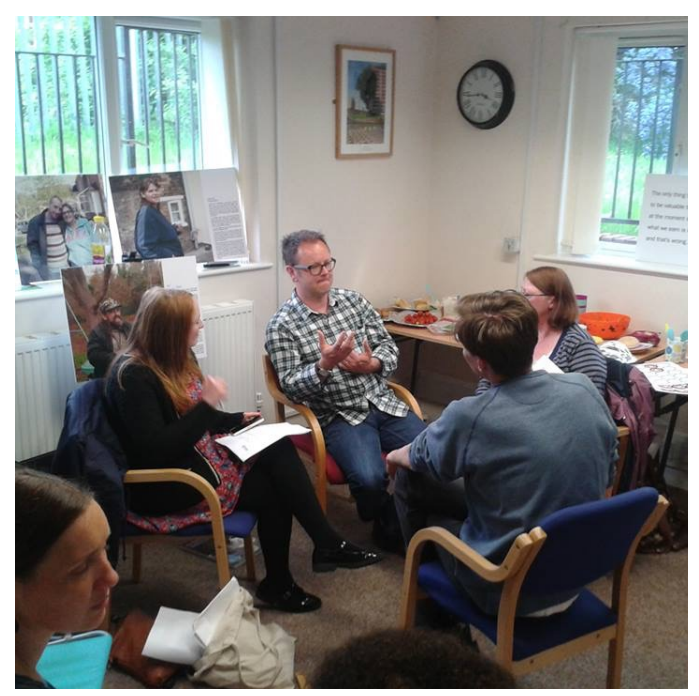
Peer-learning with the Dole Animators and Poverty Alliance