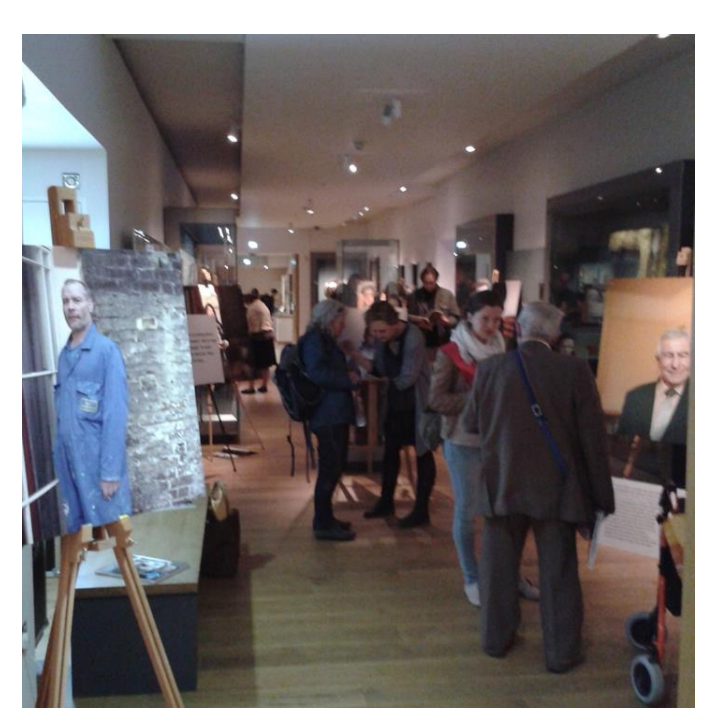
The Roles We Play exhibition at the Ashmolean Museum

"It was great that the people were real, not people in poverty doing their bit on a stage or whatever but instead having ordinary conversations with people." Passer-by