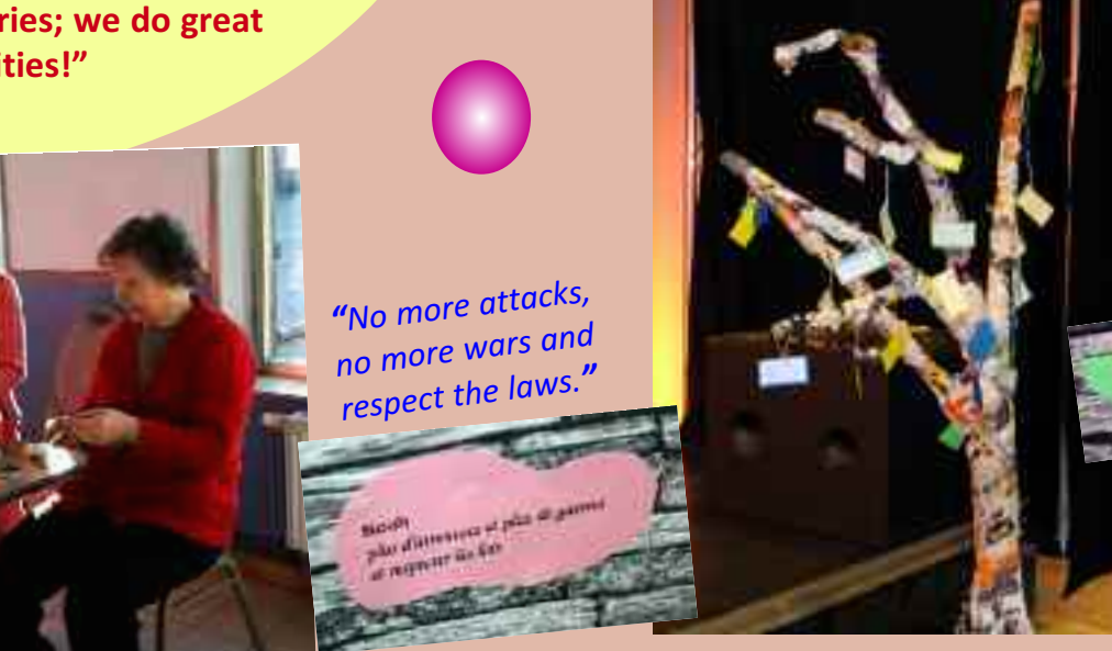
The Friendship Tree with the children's messages