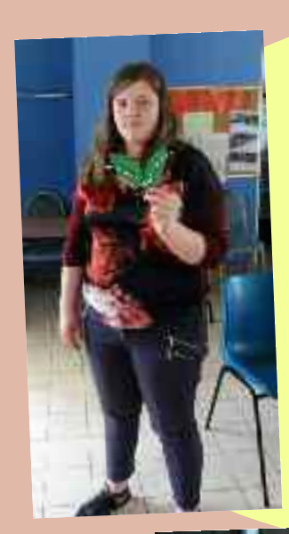
"I like to come to Tapori. We have fun; we play; we tell stories; we do great