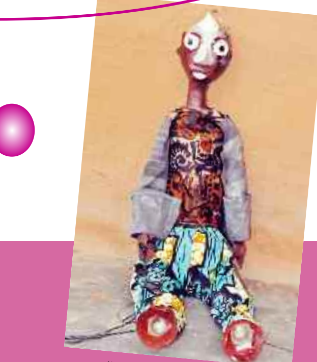
"My puppet is called Bancé."