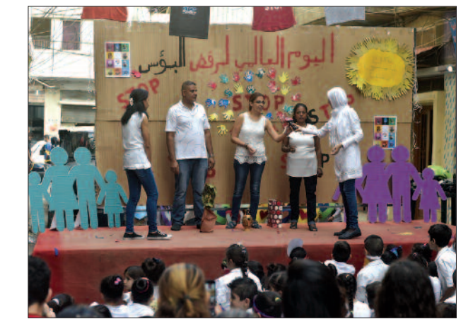
17 October, Beitouna, Lebanon.

and to "the poor of all times, still poor today, forever on the road, fleeing from place to place, despised and disgraced". He continues to inspire us to act to bring about a better world.