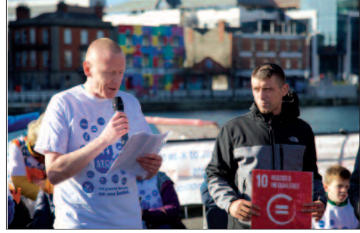
Dublin, Ireland.