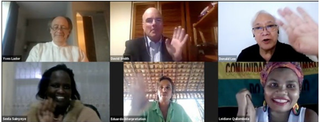
Webinar panelists and moderator.

Together, panelists will discuss how environmental conservation should not be used against the human rights of people and communities living in poverty. They will also highlight examples of communities acting to protect and preserve their environment and culture.