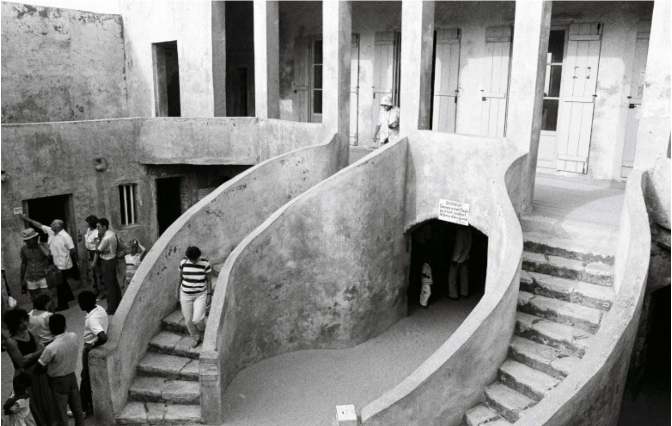
Image above: House of Slaves Museum Island of Gorée

December 2 is United Nations Day for the Abolition of Slavery . On that date in 1949, the General Assembly adopted the UN Convention for the Suppression of the Traffic in Persons and the Exploitation of the Prostitution of Others.