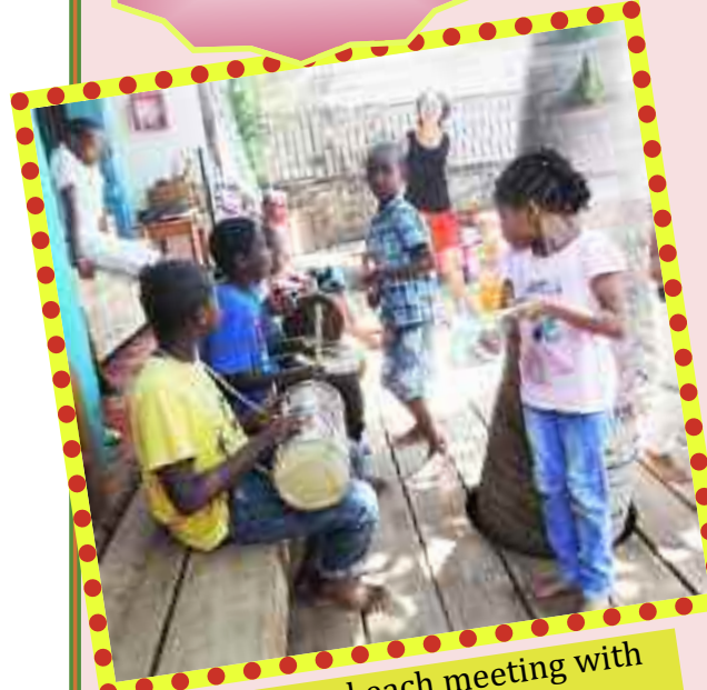
They end each meeting with music.