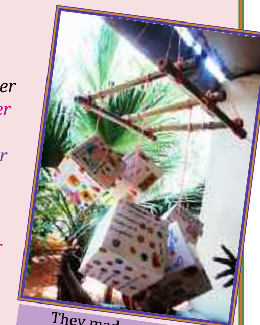
They made a mobile.