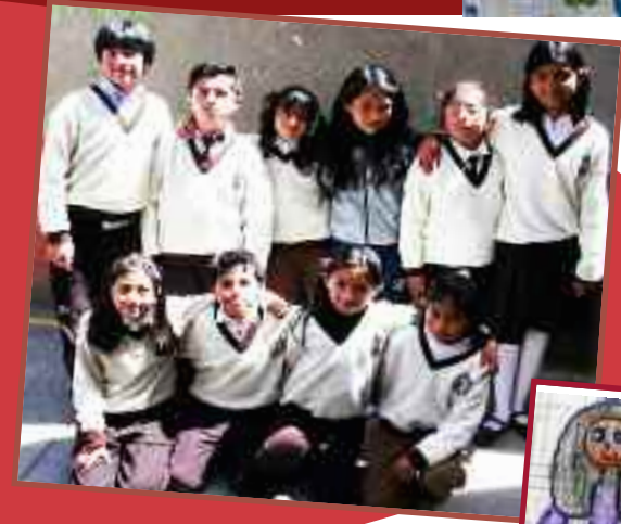
The Páter Noster Tapori Group