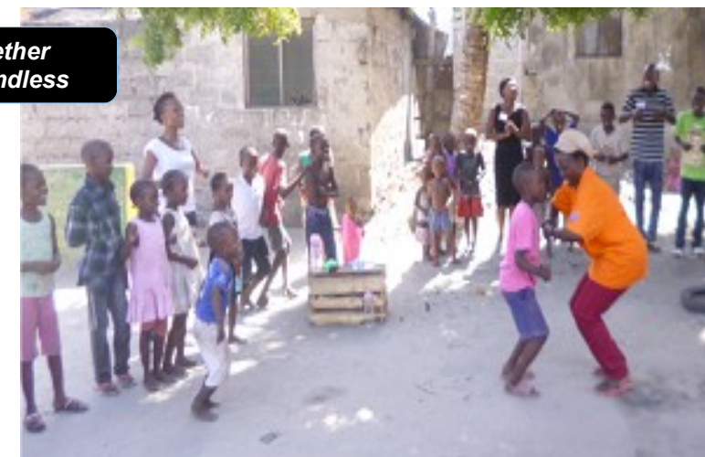
Special Street Library in Tandale. People from Congo, Kenya met and enjoyed a time of friendship before starting the seminar.