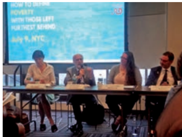
UN in NY, July 9, 2018, Side event during the High Level Political Forum