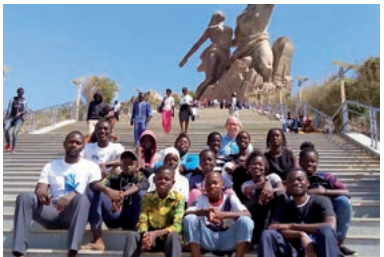
Dakar, May 2018: Knowledge in the Streets group at the African Renaissance Monument

Dakar, Senegal – ATD organized the “Knowledge in the Streets” program ( Xam xam ci Mbeed , in Wolof), with children and teens in the Grand-Yoff district of this city. For children between the ages of 4 and 11, activities were centered on books and coloring. For those aged 12 to 18, the activities included painting as well as discussions about the texts of Joseph Wresinski. The group had the opportunity to present their artistic achievements on the occasion of the Children’s International Biennial Event held in May at the African Renaissance Monument. This is a symbolic place for the group as it represents African people’s self-determination in the post-colonial era.