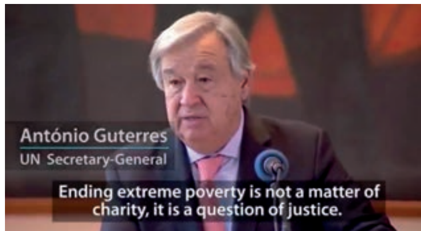
UN Secretary-General António Guterres, October 17 commemorations, New York