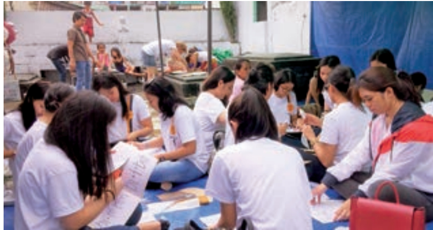
August 2018, Manila: 2 nd Ang Galing Brigade