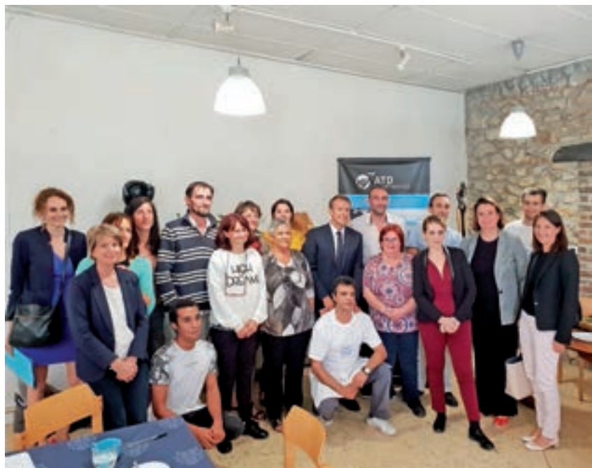
September 10, 2018: Visit of French President Emmanuel Macron to the family development center run by ATD Fourth World in Noisy-le-Grand, Paris