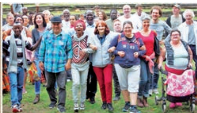
October 10-17, 2018, France: World gathering of ATD Fourth World Members