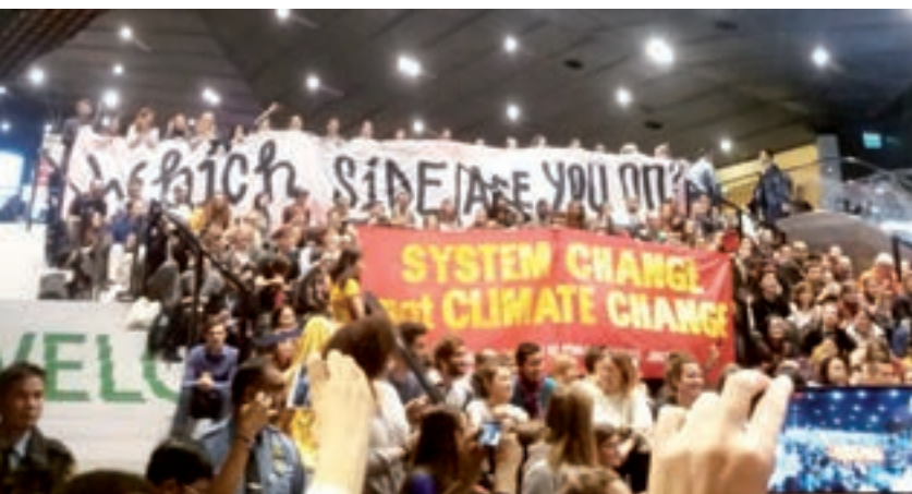
December 2018, Katowice, Poland, 24 th Climate Change Conference (COP24)

The Quaker United Nations Office (QUNO) involved ATD Fourth World in drafting its government’s official toolkit to inspire action, and support decision-makers concerned about the impact of climate change. The Poverty page written by ATD, emphasized that policies must: involve people living in extreme poverty in developing strategies for prevention, adaptation or mitigation; provide them with better energy and technology options to improve living standards; and avoid or minimize adverse impacts of climate response actions on communities in extreme poverty.