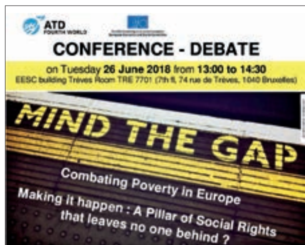
Brussels, June 26, 2018: Conference debate, "Combating Poverty in Europe"