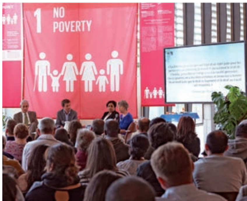
International Day for the Eradication of Poverty, October 17 commemorations at the UN Office in Geneva, 2018

Following the commemoration, they joined in a Special Dialogue on Human Rights, Participation, and Extreme Poverty organized by ATD Fourth World in coordination with the UN Department of Economic and Social Affairs and the Office of the High Commissioner for Human Rights (OHCHR). The participants highlighted the importance of involving people living in poverty in policies, and of building common references around human rights, participation, and dignity. They explored ideas about how to do this within the context of the policies of the UN and its agencies.