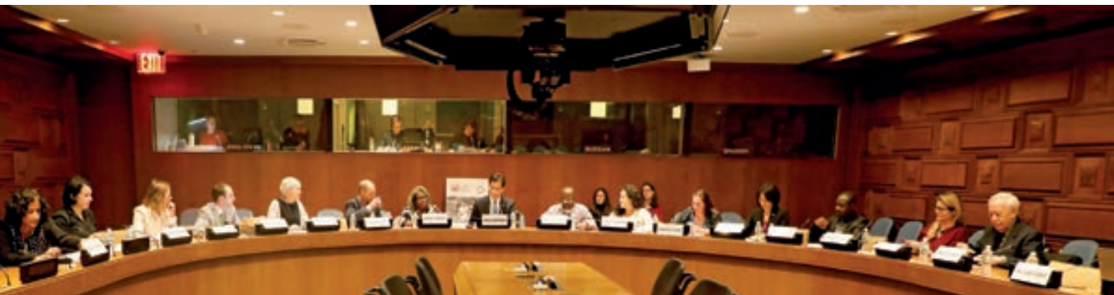
UN NY, October 17, 2018: Special Dialogue on Human Rights, Participation, and Extreme Poverty

Joseph Wresinski was convinced that eradicating extreme poverty required long-term, comprehensive global policies developed in consultation with the people directly affected. Maintaining a dialogue with international organizations, and building partnerships with them are important strategies to ensure that addressing extreme poverty remains a priority within these organizations. To this end, ATD Fourth World has