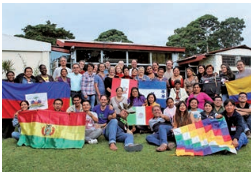
Guatemala City, October 2018: 2 nd Joseph Wresinski Forum on Poverty and Human Rights in Latin America and the Caribbean