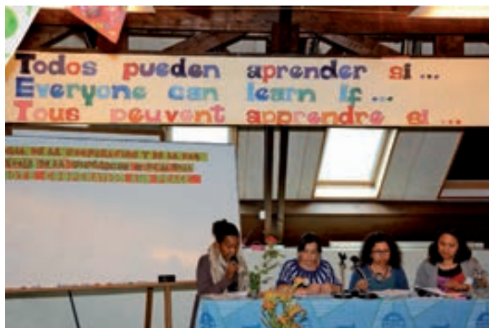
Pierrelaye, France, June 10-16, 2018: Seminar on Education

Budapest, Hungary – Working in five languages, ATD Fourth World held a three-day workshop at the European Youth Centre in Budapest. The objective was to build connections between people in different areas and of different social backgrounds. Participants included: groups from Bulgaria, Hungary, Romania, and Serbia; members of ATD-Poland and ATD-UK who have lived in poverty; as well as people and groups who are reaching out to those excluded from