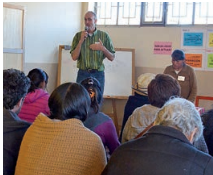
November 2018: Fourth World People's University in El Alto, Bolivia

El Alto, Bolivia – " Laws are not made for people who have little money. " This month's Fourth World People's University session focused on issues related to the justice system that confront many Bolivian families in their daily lives. Prior to the meeting, preparatory discussions were held by nine groups. The meeting focused on corruption and defamation, as well as negative attitudes or lack of attention from police and the entire justice system. More than forty participants along with their lawyers discussed tools that might enable the justice system to treat people better and more fairly. The meeting encouraged participants to continue thinking about those issues and to participate in dialogues that allow people, especially those facing extreme poverty, to recognize each other as having important information and knowledge to share.