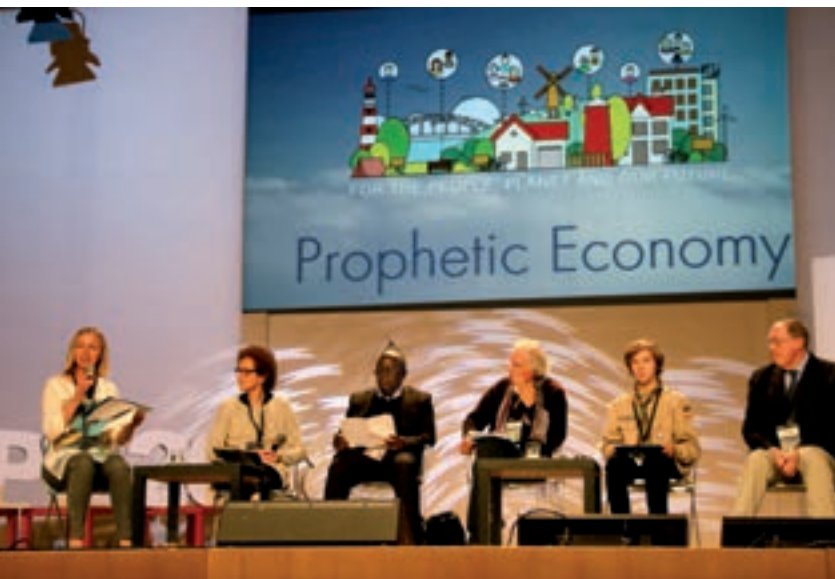
International "Prophetic Economy" event held in November 2018, Rome

Rome, Italy – Last November, an ATD Fourth World delegation of volunteer corps members, representatives of the social enterprise Working and Learning Together (TAE), and the French NGO ECCOFOR ( Ecouter, Comprendre, Former ) [Listen, Understand, Train] were among five hundred participants from forty countries for a three-day event in Rome about the "Prophetic Economy". In all their contributions, including a workshop for 150 people, the seven ATD delegates emphasized the need to consider the opinions of people in situations of poverty and exclusion in socially-oriented, solidarity and environmentally proactive economic experiments. They presented ATD projects in France (TAE [Travailler et Apprendre Ensemble]), Guatemala ( Trabajar y Aprender Juntos or TAJ), and Madagascar ( Miasa Mianatra Miaraka or MMM), as well as ECCOFOR activities. These projects were among 135 initiatives presented at the event showcasing economic practices that create significant change, leading to sustainable development or an economy in which prosperity is shared.