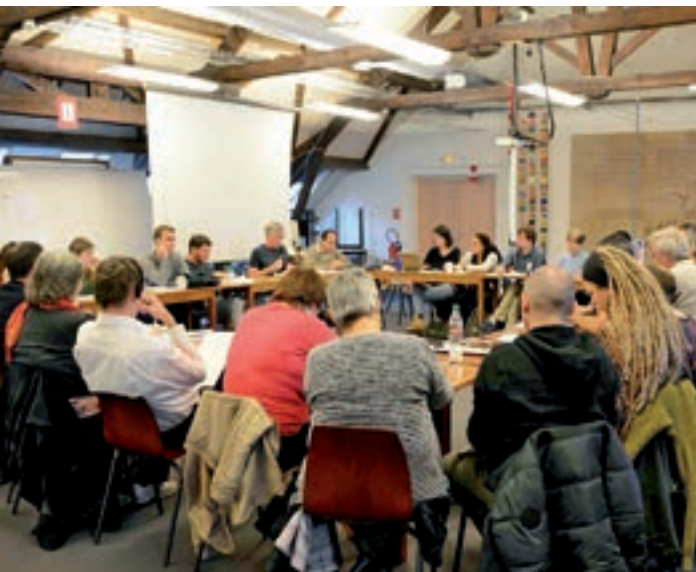
January 2018: European youth gathering at Pierrelaye, France

International Center – Young people engaged in overcoming poverty participated in a training seminar on January 13-17. The forty participants from several countries shared experiences and lessons learned from projects with young people, to find effective ways to conduct activities in which youth can take part. Forum Theater emerged as one of ATD’s benchmark tools in motivating youth to work towards a more just society. This method helps young people think about difficult situations they have been in and find solutions together with the audience.