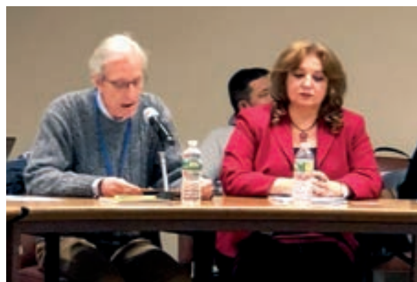
February 3, 2018, side event during the 56th Commission for Social Development

The 56 th Session of the Commission for Social Development, held at the UN in New York, was focused on “ Strategies for Eradicating Poverty to Achieve Sustainable Development for All .” ATD Fourth World was involved in promoting a draft resolution on social protection floors and poverty eradication, which successfully influenced the Commission’s final document. ATD Fourth World also organized a side event with partner organizations: the Global Coalition on Social Protection Floors, Bread for the World, the International Trade Union Confederation (ITUC), and the NGO Committee for Social Development. The event was entitled “Social Protection Floors as Key Tools for Eradicating Poverty: