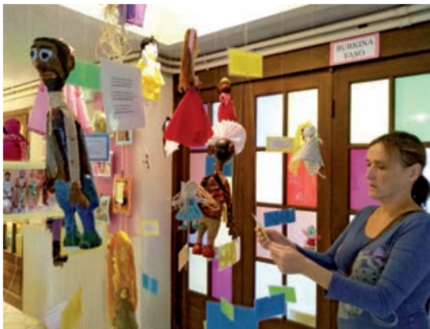
Tapori’s Puppet Exhibit of Messages of Friendship installed at the International Center of ATD Fourth World in Méry-sur-Oise, France

After a festive year celebrating its 50 th anniversary, Tapori has refocused on its daily life on: building bridges between children from different backgrounds; telling others about their courage; and supporting those who work with them. In October the Tapori secretariat organized a puppet exhibit of messages of friendship, for primary schools of Méry-sur-Oise, the town where the ATD International Center is located, as well as for visitors to the center.