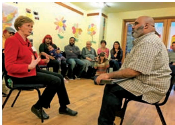
December 2018: Fourth World People's University in New York

El Alto, Bolivia – " Laws are not made for people who have little money. " This month's Fourth World People's University session focused on issues related to the justice system that confront many Bolivian families in their daily lives. Prior to the meeting, preparatory discussions were held by nine groups. The meeting focused on corruption and defamation, as well as negative attitudes or lack of attention from police and the entire justice system. More than forty participants along with their lawyers discussed tools that might enable the justice system to treat people better and more fairly. The meeting encouraged participants to continue thinking about those issues and to participate in dialogues that allow people, especially those facing extreme poverty, to recognize each other as having important information and knowledge to share.