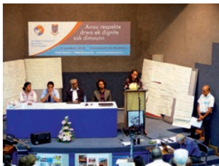
October 13, 2018, Mauritius Island: October 17 commemorations held at the University of Mauritius