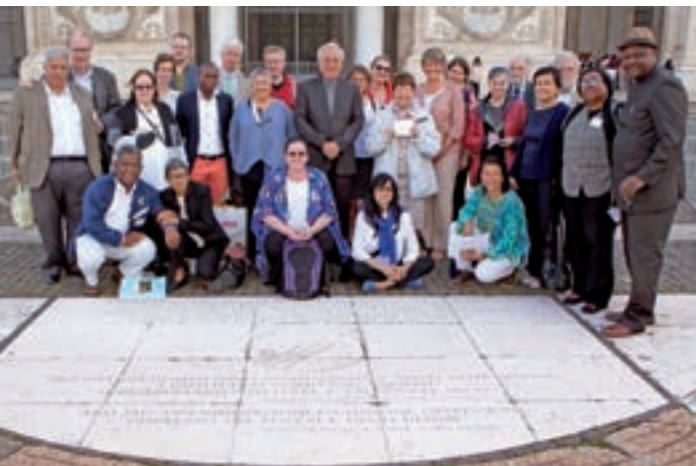
Biennial Meeting of the International Committee for October 17 held on May 15-17, 2018, in Rome

The International Committee for October 17 th met in Rome in May, and called upon the UN to update its 2006 review of the observance of the International Day for the Eradication of Poverty, and to ensure that people living in extreme poverty effectively participate and have a voice at the UN. It also announced the 2018 theme for October 17 th : “Coming together with those furthest behind to build an inclusive world with universal respect for human rights and dignity.”