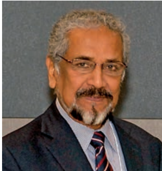
Réunion Comité International 17 octobre - New York, USA mai 2012

During the year under review, ATD Fourth World, in its efforts to eradicate poverty, its assistance in implementing the 2030 Agenda for Sustainable Development with its 17 Sustainable Development Goals (SDGs), left no stone unturned in promoting the concept of ‘leave no one behind’ and in doggedly working to bring to the fore the voices of people living in poverty. By maintaining a constant dialogue with the international community, through various UN agencies and other institutions, ATD Fourth