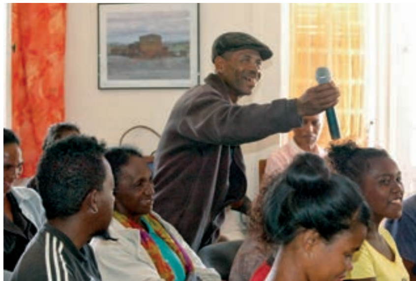
Fourth World People’s University in Madagascar, January 2018

International Center – Young people engaged in overcoming poverty participated in a training seminar on January 13-17. The forty participants from several countries shared experiences and lessons learned from projects with young people, to find effective ways to conduct activities in which youth can take part. Forum Theater emerged as one of ATD’s benchmark tools in motivating youth to work towards a more just society. This method helps young people think about difficult situations they have been in and find solutions together with the audience.