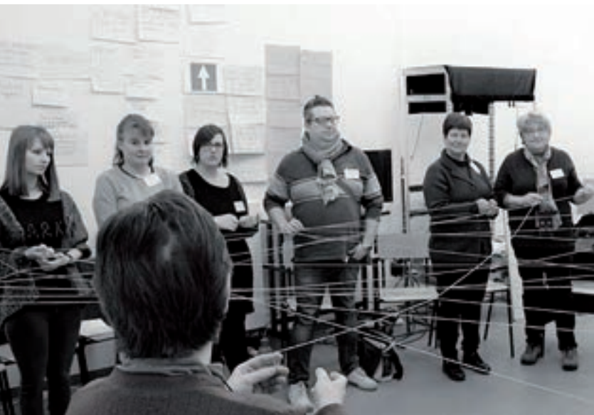
Merging Knowledge session, February 2018, Brussels

This seminar gave participants the opportunity to listen and be listened to, to learn, and to get some relief from daily struggles. Such benefits give them motivation and strength to participate and think of actions to take together.