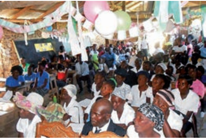
October 17 commemorations in Haiti

Reunion Island – ATD Fourth World renewed its partnership (formed in 2017) with the Regional Social Work Institute of Reunion (IRTS). From October 22 to 26, nine ATD activists and a volunteer corps member trained more than two hundred of the institute’s students. The future professionals benefitting from this training were students in their first or second year of training at IRTS, plus a group of experienced social science trainers. The opportunity both excited and destabilized students, making them realize much more concretely the challenges they will have to face in order to truly serve underserved populations.