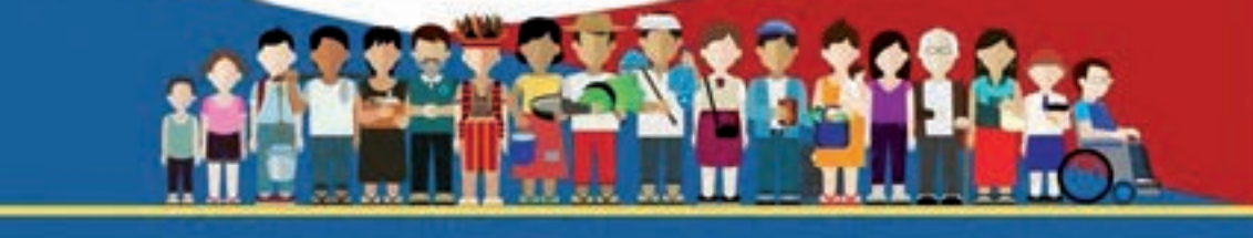
October 17 commemoration banner, ATD Fourth World Philippines