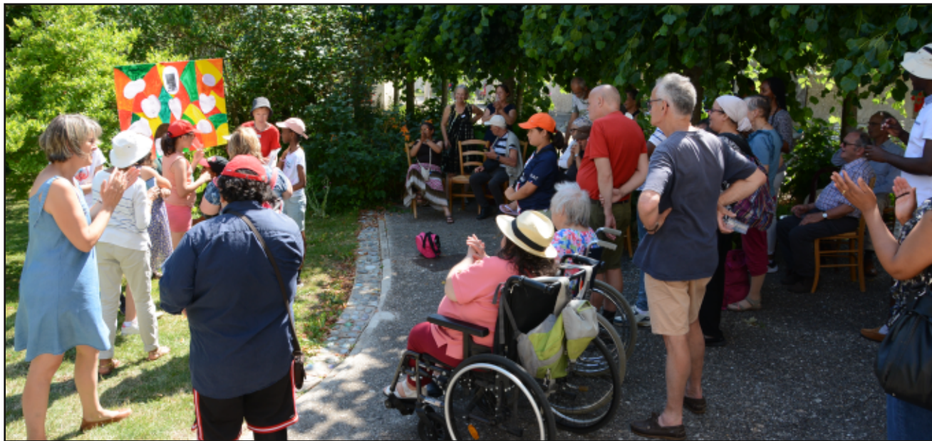
Family day for members from Yvelines and Val d'Oise