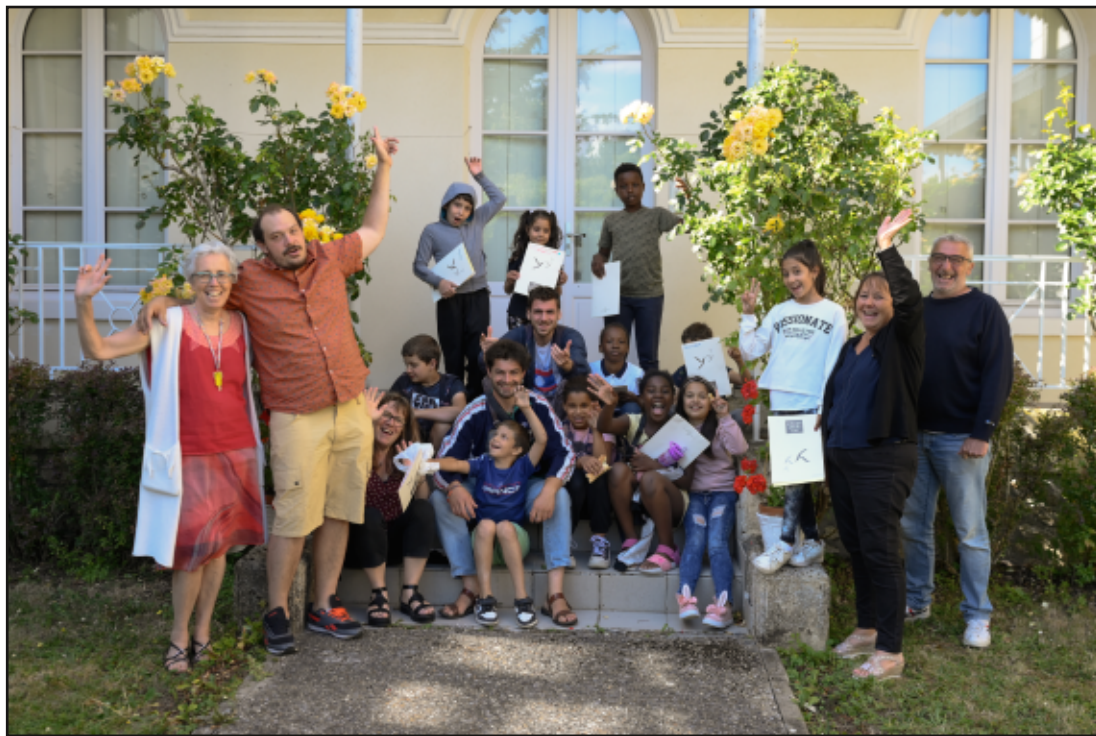
Welcoming the young photographers from the Culturel Hub in Noisy-le-Grand

Centre Joseph Wresinski, 2023