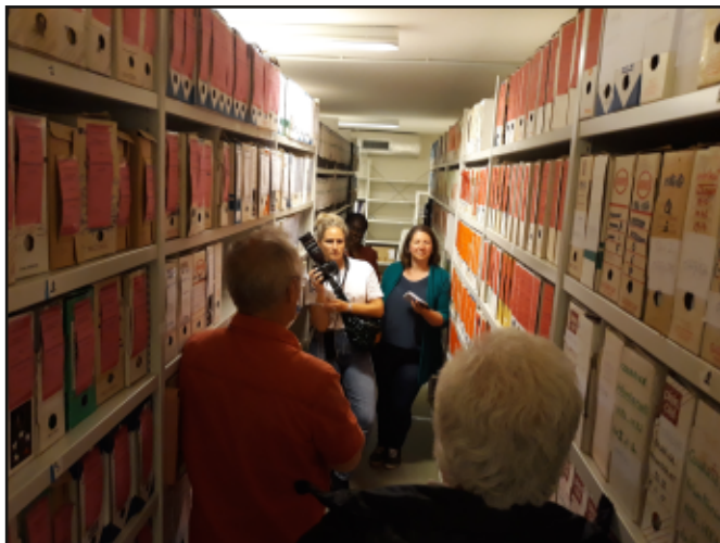
Centre Joseph Wresinski, 2023