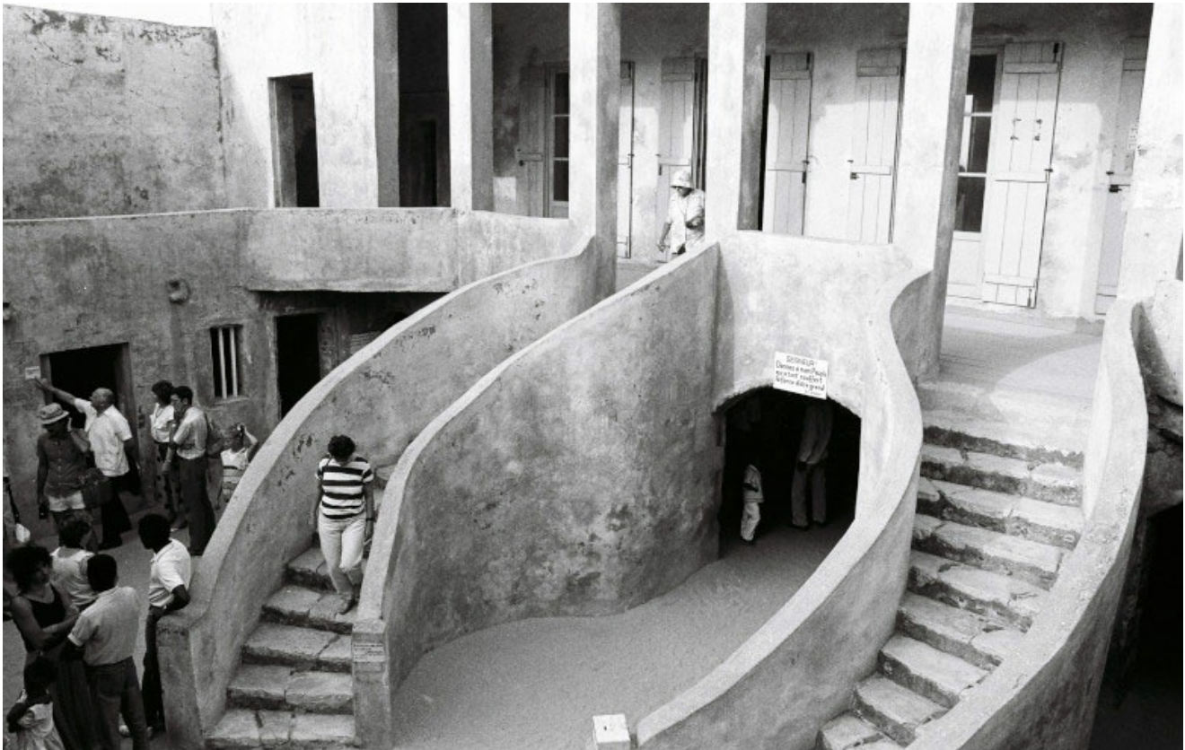
Image above: House of Slaves Museum Island of Gorée

December 2 is United Nations Day for the Abolition of Slavery . On that date in 1949, the General Assembly adopted the UN Convention for the Suppression of the Traffic in Persons and the Exploitation of the Prostitution of Others.