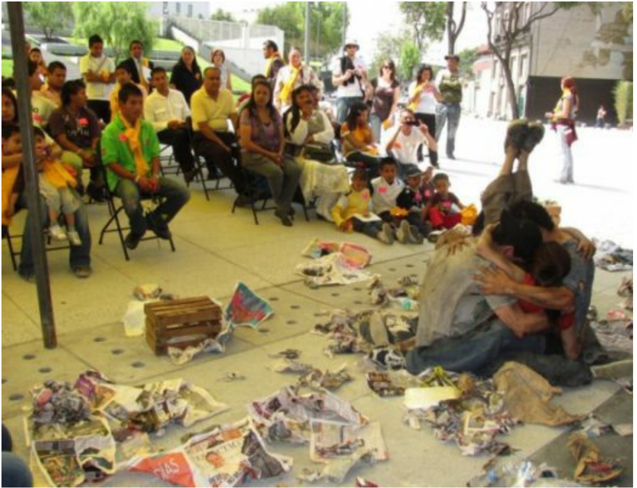
Musical improvisation facilitated by the Music Therapy foundation Street Theatre group