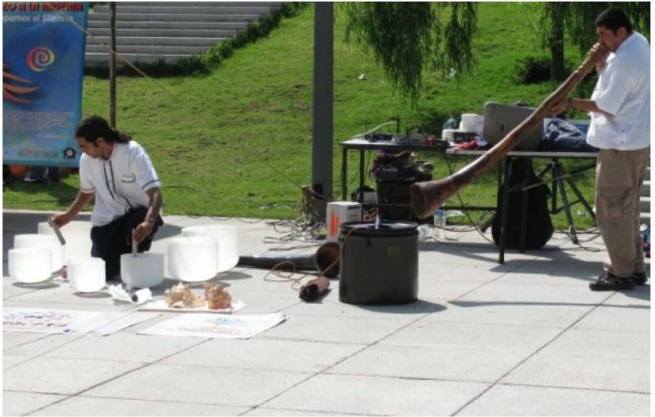
Musical improvisation facilitated by the Music Therapy foundation