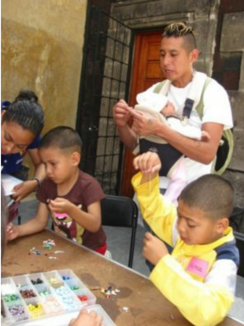
Workshop facilitated by the Inter-American Foundation for Integration and Social Development

The unveiling was attended by many celebrities and government representatives. Afterwards, the Union of Small-Business Owners for Community Well-Being, the Street Theatre group, and the Machincuepa Circo Social (part of the Cirque du Soleil group) presented a variety of theatrical performances.